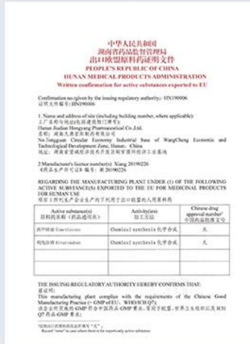
EU Written Confirmation