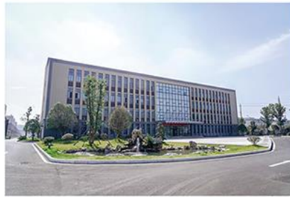
Hongyang site / 宏阳工厂