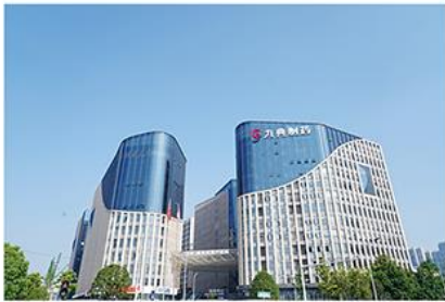
Headquarters / 总部

九典制药（证券代码 300705）于 2001 年成立，2017 年上市，是一家集科研、生产、销售于一体，在制剂、原料药、药用辅料和植物提取物全方位布局的研发驱动型的 GMP 制药上市企业。目前拥有两家工厂，员工 1200 余人，其中科研人员超过 300 人。