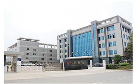
Liuyang site / 浏阳工厂